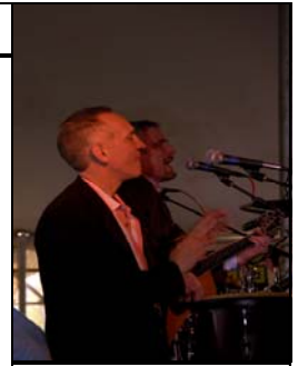
band e leet

On Friday, May 6, 2005, TwoCan Marketing hosted their Second Annual 'Evening of Champions' at WinStar Farm benefiting The Makenna Foundation, the Race for Education, and the Kentucky Restaurant Educational Foundation. In addition to great food by Selma's Catering, the event had fabulous entertainment from Caught Red Handed , band e leet and The Little River Band . In addition to food and entertainment there was a Live Auction and a Silent Auction with over 100 items! The Makenna Foundation would like to thank TwoCan Marketing, Selma's Catering, Post Printing, and Clear Channel Radio along with many others for all of their support of the event.